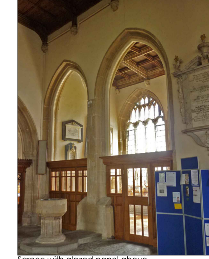
Screen with glazed panel above